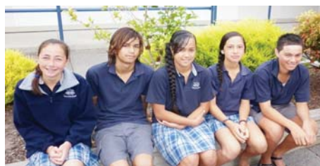
TPI Athletic champions 2011

Te Puke Intermediate Athletics team had an extremely successful day at the Bay of Plenty/ Poverty Bay Athletics Championship held at Tauranga Domain Friday 25 November. Congratulations to the following students: